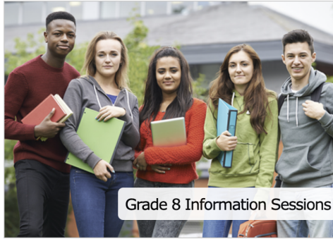
Grade 8 Information Sessions